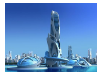
Future of Work