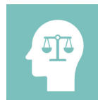
Social Capital Is Like Money in the Bank