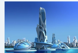
Future of Work Channel