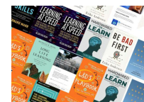
Reskilling & Upskilling