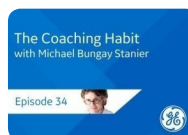
The Coaching Habit