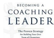
Becoming a Coaching Leader