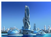
Future of Work