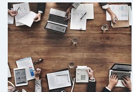
Strategic Planning Channel