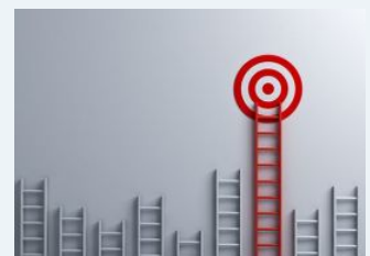
Goal Setting Channel